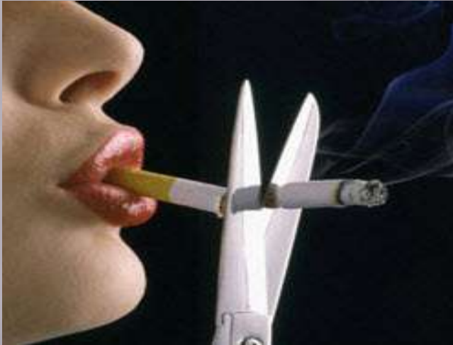
Cognitive Behavioural Therapy