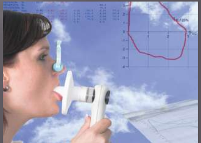
Pulmonary Function Testing